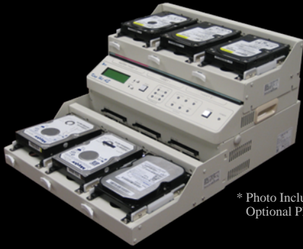
* Photo Includes Optional Plug-In Jigs