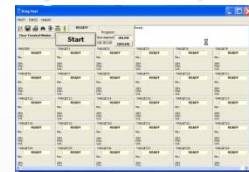
(Screenshot of 30 Port Host)

YEC Host Software allows the user to remotely manage every HDD port while automatically generating Log Files for each copied hard drive.